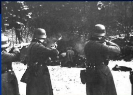
Einsatzgruppen: Nazi Killing Squads